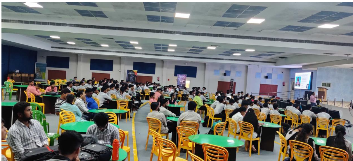
Image 3. Students from various disciplines