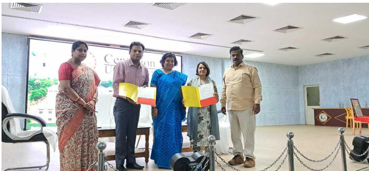
Image 4. MoU Signing with ETS@I to support students with learning materials & guidance

The session announced the master class schedule for May 2024, covering topics such as GRE Vocab Made Easy, Reading Comprehension, A Roadmap to GRE Sentence Equivalence, A Roadmap to GRE Text Completion and A Roadmap to GRE Analytical Writing Assessment. Participants were encouraged to utilize these resources to enhance their exam preparation efforts. The session concluded with an emphasis on making the most of the provided resources to shape their academic journey effectively.